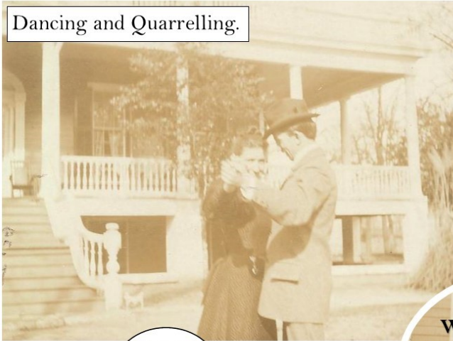
Dancing and Quarrelling.